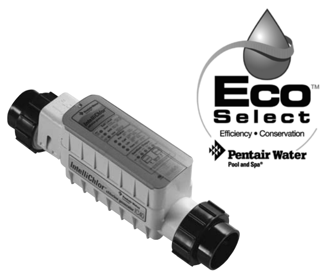
IntelliChlor® Salt Chlorinator

IntelliChlor Salt Chlorinator uses common table salt to produce all the chlorine a pool needs, safely, effectively, and automatically. Same sanitation performance as manual chlorine addition without the drawbacks. No need for customers to buy, transport and store chlorine compounds.