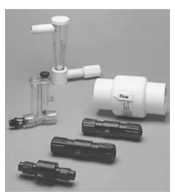
In-line Check Valves & Flow Indicators