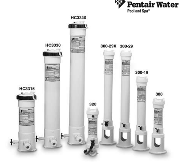
Rainbow Chlorine and Bromine Feeders

• 300 Series . Retrofits into existing pools or spas. Operates on pressure side of pump. Uses 1/4 in. feeder hoses, control valve and fittings.