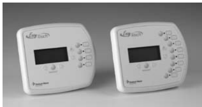
520548 - EasyTouch ICP for 4 circuit systems 520549 - EasyTouch ICP for 8 circuit systems 520546 - EasyTouch wireless for 4 circuit systems 520547 - EasyTouch wireless for 8 circuit systems