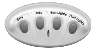
iS4 Remote Control