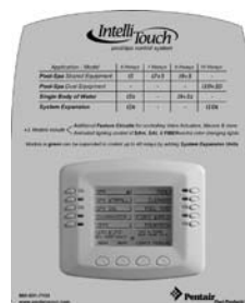
IntelliTouch Demo Unit