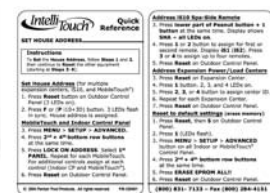
Quick Reference Card