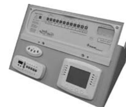
IntelliTouch Laptop Trainer