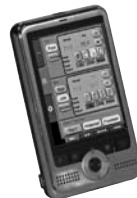
PDA Color Touch Screen