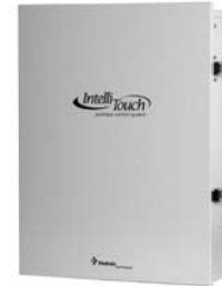
Load Center (P/N 521213)

New for 2010 - Pentair has a new Load center and Power Center that features more space for wiring, space for 10 breakers, more knockouts, 150 Amps limit and, for added convenience, IntelliTouch enclosures can now be ordered with the IntelliChlor transformer integrated so a separate power center is no longer required.