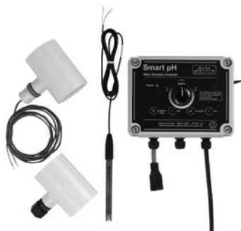
Smart pH Control System

The Smart pH is designed for any application where simple, automatic pH control is desired. It is the perfect companion for the IntelliChlor Salt Chlorinator, which automatically produces chlorine from common, safe salt. A byproduct of chlorine generation is a steady increase in water's pH, which can be harmful to the pool (e.g. plaster scaling) and very detrimental to the bather experience. The typical method of controlling pH is to manually add large amounts of pH correction "as needed", which sometimes means "when remembered". The Smart pH regularly feeds "correction" in small amounts to keep the water in range at all times automatically, and in the most simple to use and economical package in the industry.