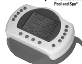
MobileTouch Wireless Remote & Cradle