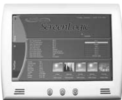
Color Touch Screen