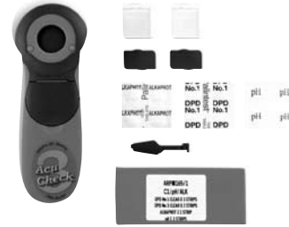
AcuCheck3 Test Kit