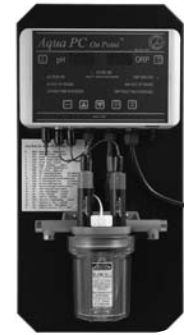
AquaPC OnPoint Control System

For use with Commercial IntelliChlor Salt Chlorinator - The AquaPC OnPoint is the perfect companion for the Commercial IntelliChlor Salt Chlorinator. Unlike the standard IntelliChlor, the commercial unit requires a device to tell it when to feed sanitizer. The AquaPC OnPoint fills this need, while also automatically reducing pH - a necessity with salt chlorination.