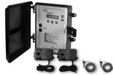
SunTouch Control System Pool/Spa - (520820)