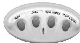
iS4 Remote Control