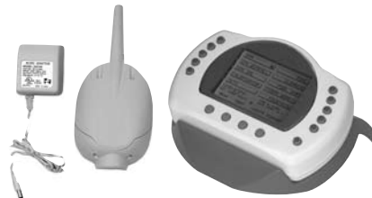
MobileTouch Wireless Remote