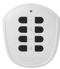
QuickTouch II Remote