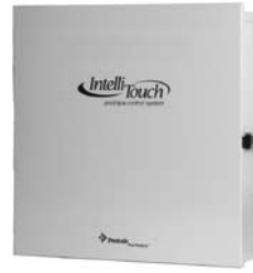
Power Center (P/N 521214)