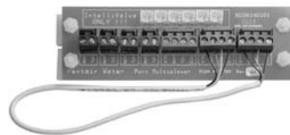
520818 - COM Port Expansion Module