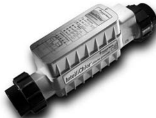
520554 - IntelliChlor IC20 Cell 520555 - IntelliChlor IC40 Cell 521105 - IntelliChlor IC60 Cell