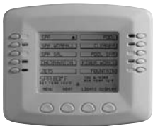
Indoor Control Panel