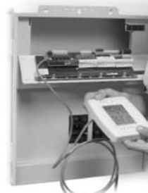
IntelliTouch Service Panel