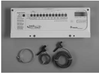
i9+3 Personality Kit (shared equipment)