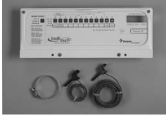
i5+3 Personality Kit (for single body of water)