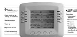
IntelliTouch ICP POP Display