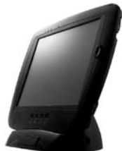
Wireless Tablet Color Touch Screen