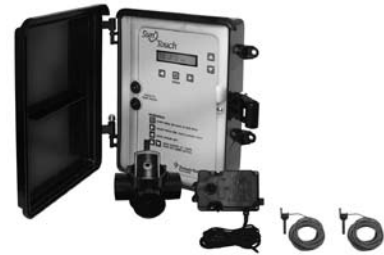
SunTouch Solar Control System (520819)

SunTouch is the easy way to keep your pool and spa clean, comfortable, and ready to enjoy. With the touch of a few buttons, you can quickly program your pool and spa filtration and heating cycles to fit your schedule. And it's just as simple to change programs or switch to manual mode for those unplanned, spontaneous plunges. With SunTouch, your pump and heater automatically run whenever you want, for as long as you want so your pool and spa are always warm and inviting.