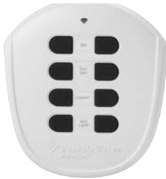
521209 - QuickTouch II Wireless Remote